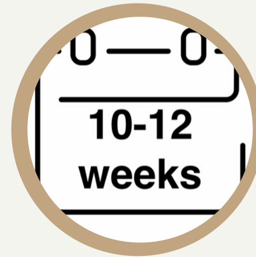
Production & Shipping